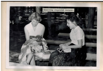
Campers needed adult participation then...they still do today.

Just as Scripture memorization is not only for kids, so also the singing, study, and fellowship of camp are not just for kids! How can an adult like you help at SMF Camp?