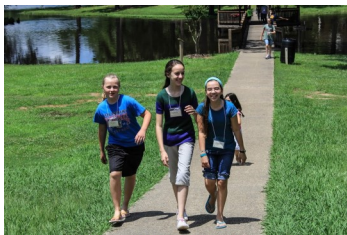
How will you help?

Pray: for the seed of the memorized Word to bear fruit, both during and after the week of camp.